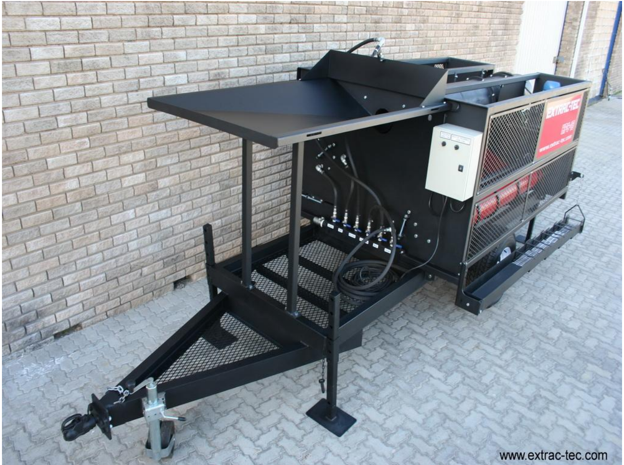
Manual Feed Chute installed on HPC-15